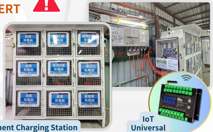
Site Equipment Charging Station