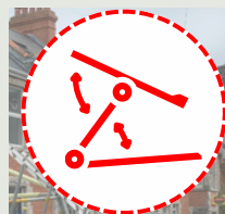
Tilt Angle 結構傾斜度