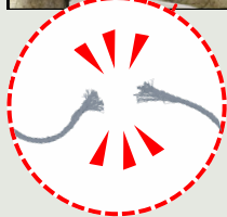
Wall Tie / Tie Status 連牆器狀態 / 拉搥狀態