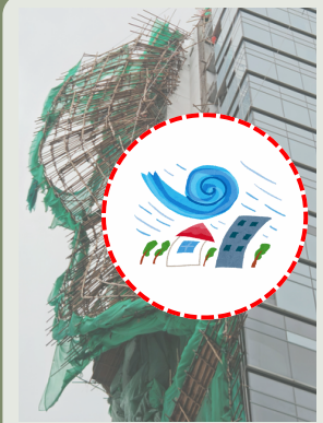
Vibration / Acceleration 振動 / 加速度