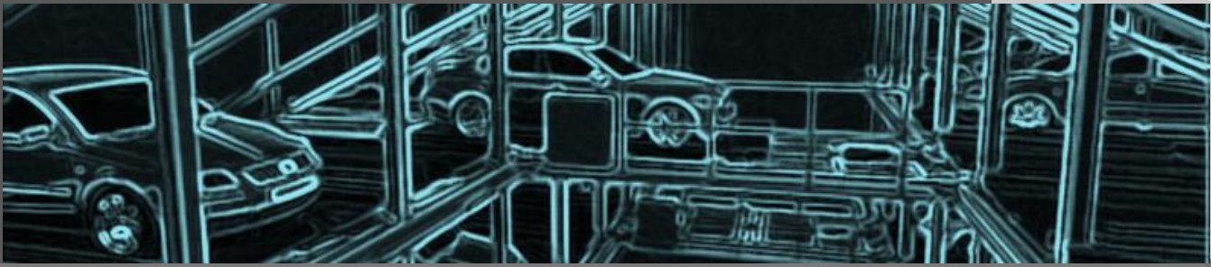
Simple Lifting (PJS) 簡易升降